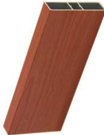
Western Red Cedar