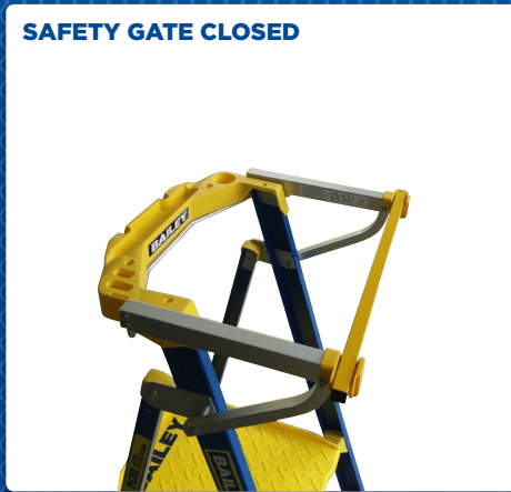
SAFETY GATE CLOSED