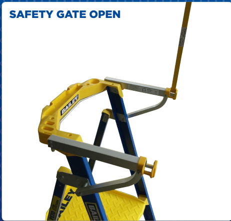
SAFETY GATE OPEN