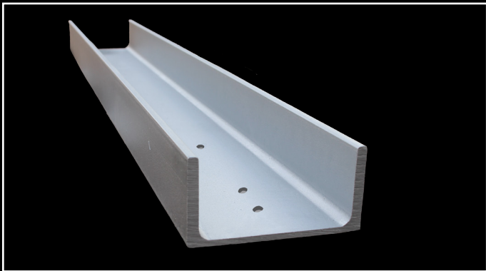
150PFC (C Post)

The new range of 150mm Series Galintel® Retaining Wall Posts is designed to provide easy installation for civil work and landscaping.