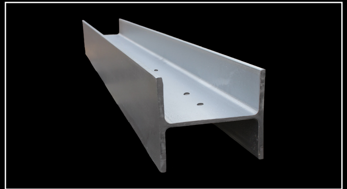
150UC23.4 (H Post)